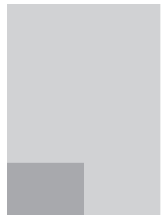
1/8 page 130mm x 90mm Horizontal

Total Column cm - 36cm Price - $320.00 Plus GST