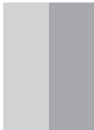
1/2 page 130mm x 360mm Vertical

Total Column cm - 72cm Price - $510.00 Plus GST