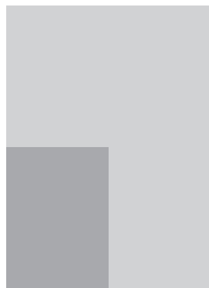
1/4 page 130mm x 180mm Vertical

Total Column cm - 48cm Price - $400.00 Plus GST